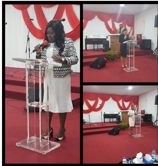
Daughters of Favour and Faith Conference