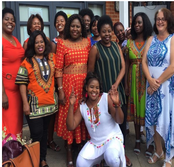
Fellowship with Reading women