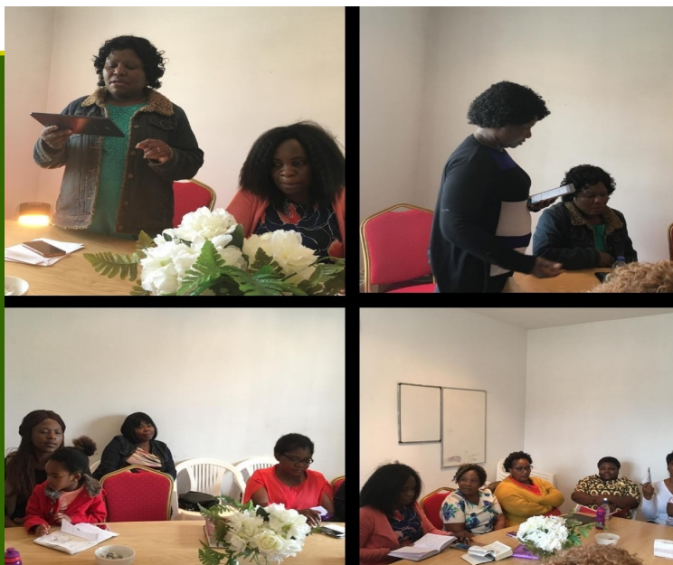
Bible Study - 15th September (Notts)